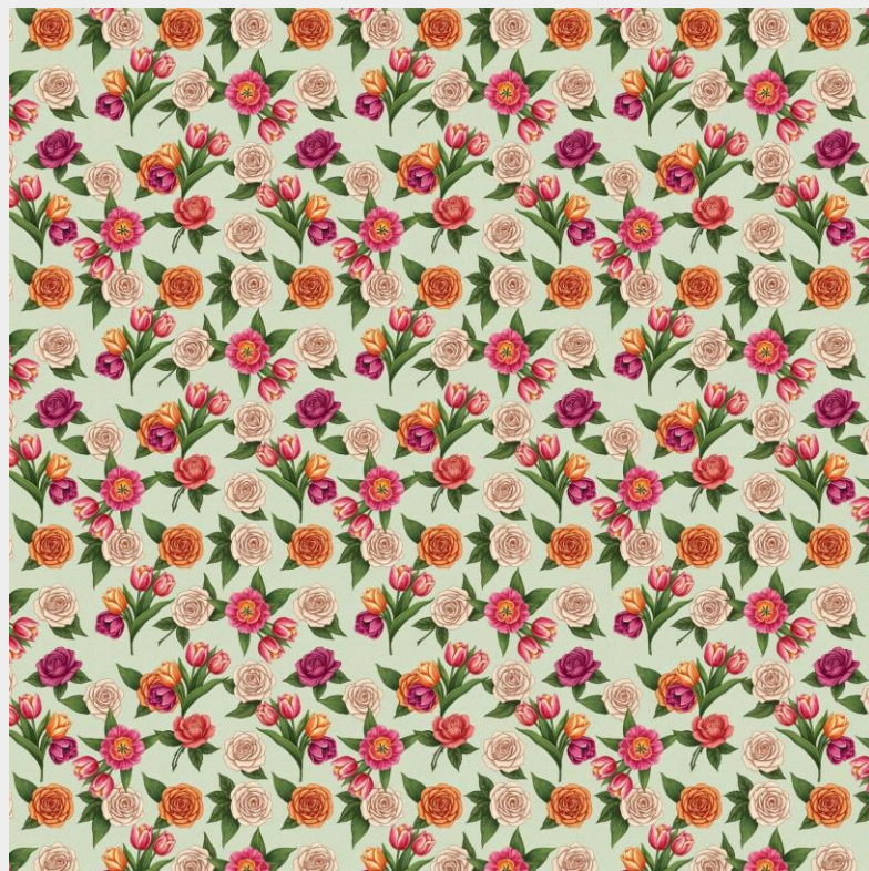
Tulips and roses pattern, seamless repeating pattern, tileable edges, perfectly aligned top/bottom/left/right