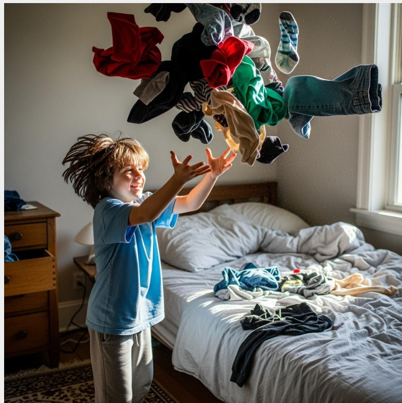
Photo of a child throwing clothes into the air, bedroom, natural lighting imperfections, unfiltered, casual snapshot