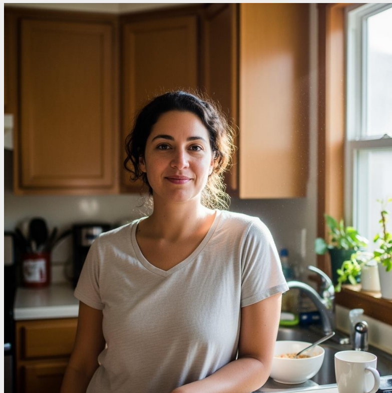
Portrait of a woman standing in a kitchen, unfiltered