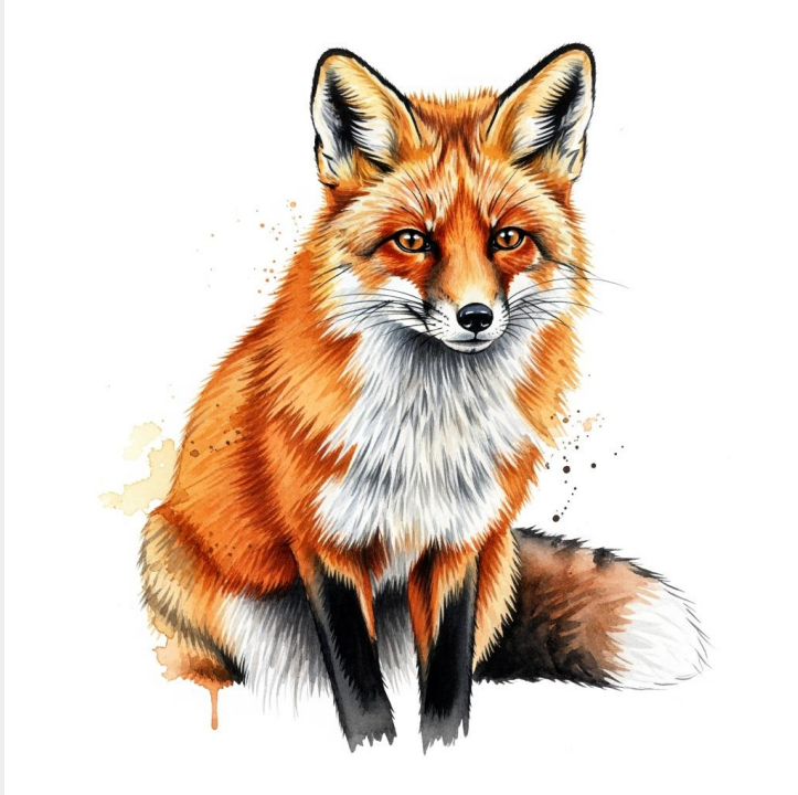
Watercolor of a fox, isolated on white