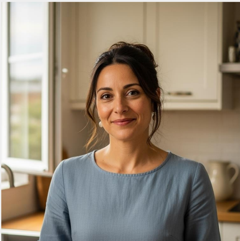
Portrait of a woman standing in a kitchen