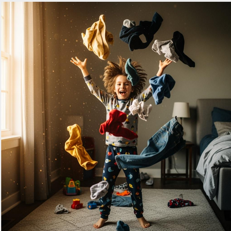
Photo of a child throwing clothes into the air, bedroom