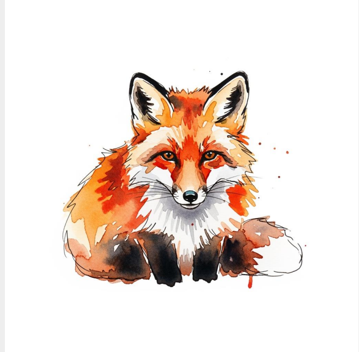
loose watercolor of a fox, isolated on white, loose , minimal detail , large expressive brushstrokes